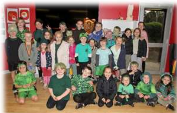
The victorious TOLMER team with the Sports Day shield