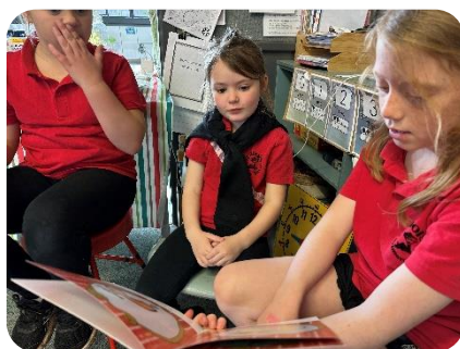
Shared reading and science week experiments with the 3/4 class helping out the R/1

We appreciate your honest feedback to help us improve at Jervois Primary School!