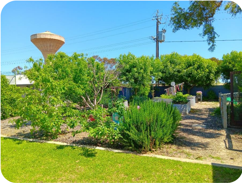
LOOK how our garden has grown!!