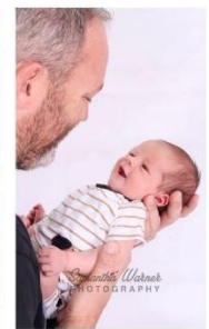
9 William st Jervois