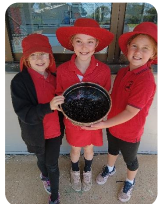
peas, mulberries...we've been busy gardeners!